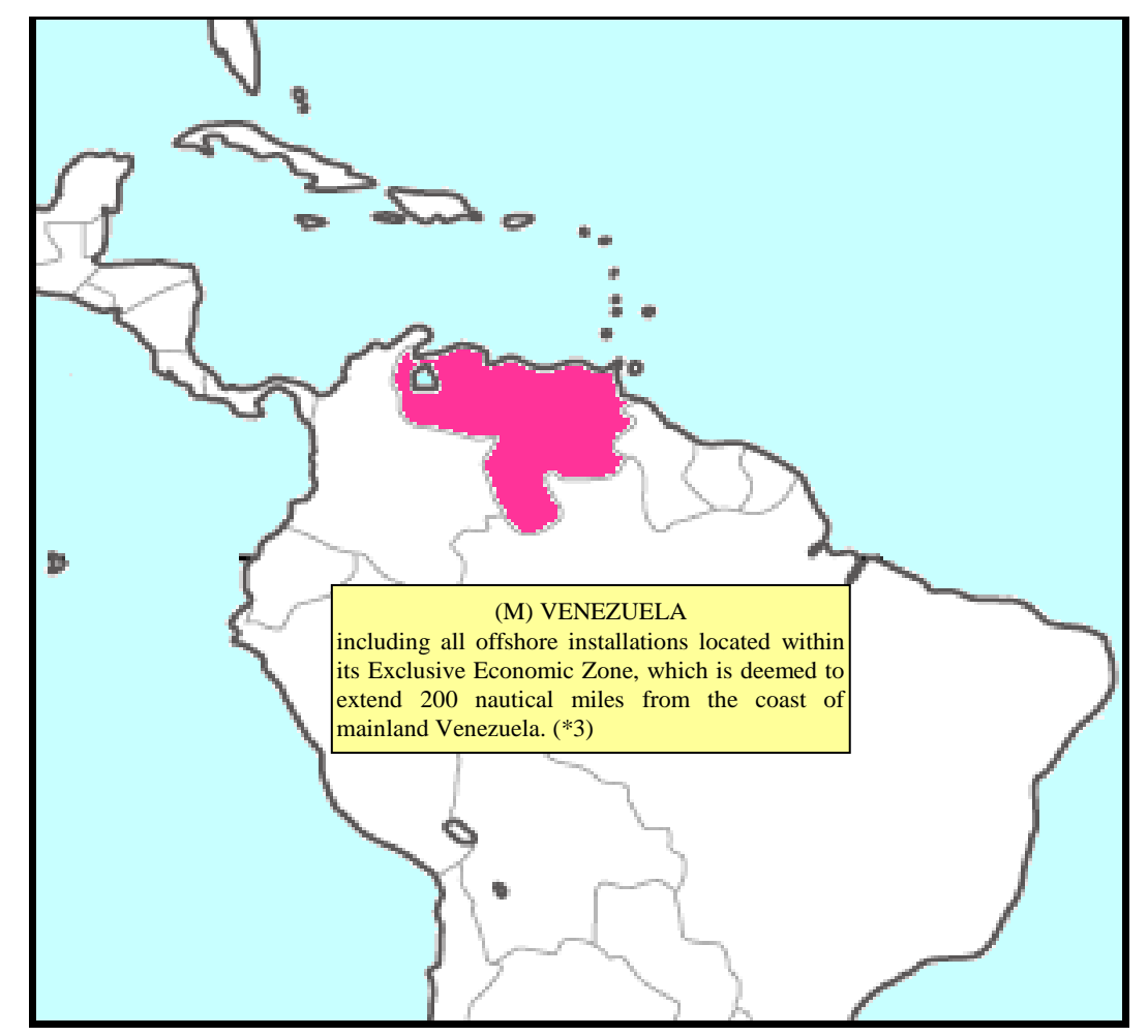
The South American Continent

*3 This area shall not include any installations in the above area which are in the territorial waters, out to 12 nautical miles, of Islands, Dependencies or Countries which are not owned by Venezuela