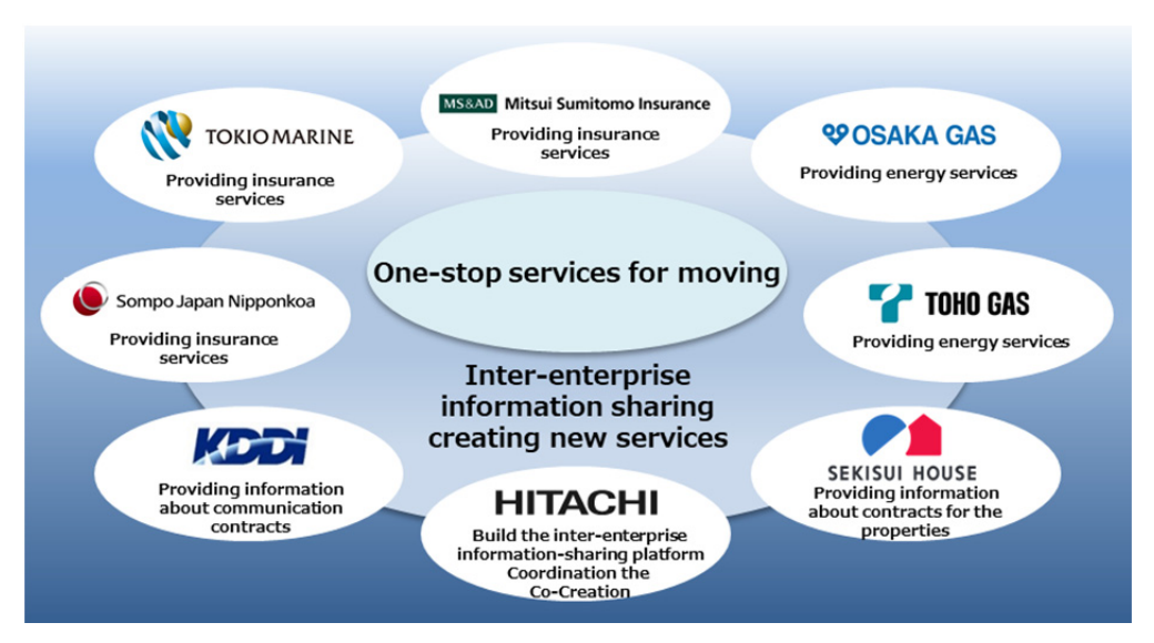
<Respective Roles of Companies in the Collaborative Creation>