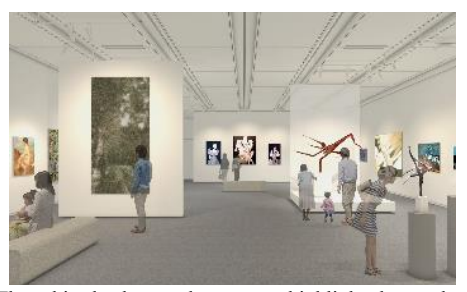
The white background serves to highlight the works. The room layout is highly adjustable so that works can be exhibited in various different ways.