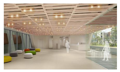
The entrance hall welcomes visitors with its elegant tiled floor, white walls, and wooden ceiling. The large orifice, that allows visitors to pass from the street side of the building to our headquarters, links the city and the museum.