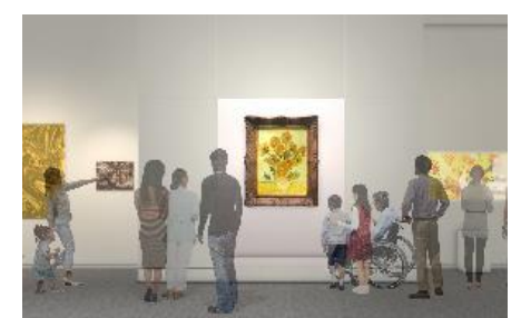
Van Gogh's " Sunflowers ", the masterpiece of our collection, is displayed in a way that visitors could get closer the work.