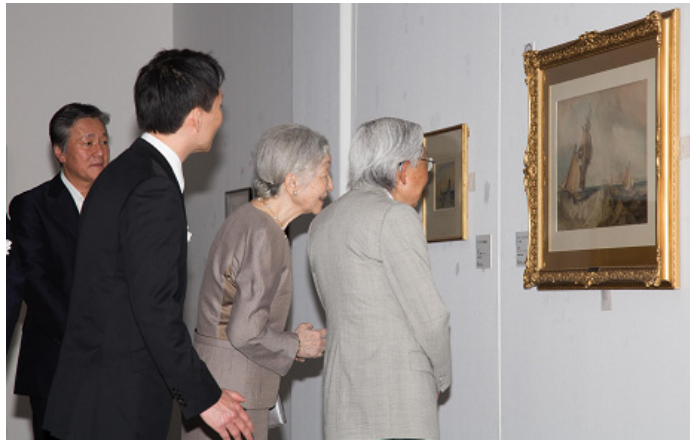
Their Majesties seeing "Off St Alban's Head"